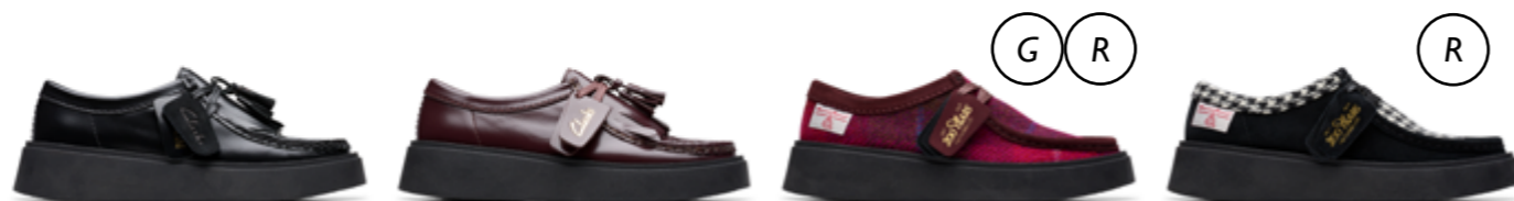
Black Leather | CL26184943 | RRP 1699 | Purple Grape | CL26184947 | RRP 1699 | Plum Interest | CL26184947 | RRP 1899 | Black Tweed | CL26184945 | RRP 1899