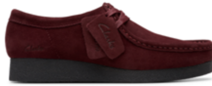
Merlot Suede | CL26184611 | RRP 1499