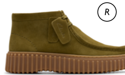
Olive Suede | CL26183872 | RRP 1599