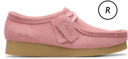
Dusty Rose Sde | CL26184536 | RRP 1499