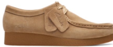
Dark Tan Suede | CL26174747 | RRP 1499