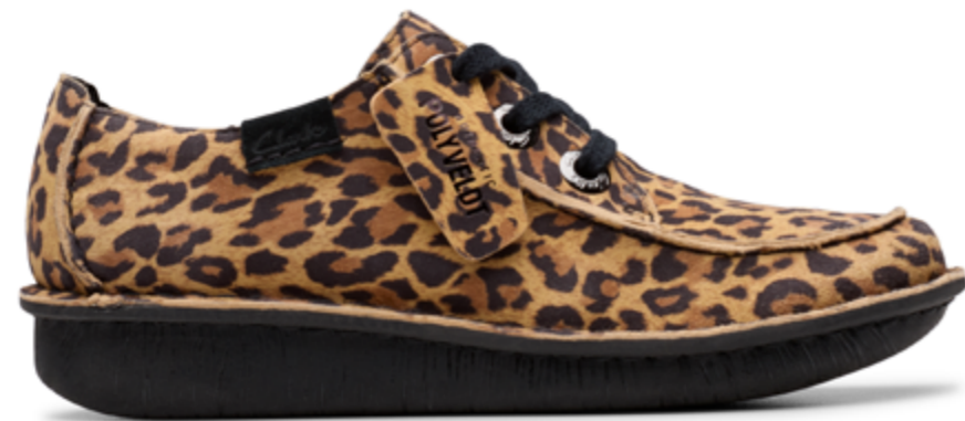
Leopard Suede | CL26183040 | RRP 1399