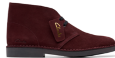
Merlot Suede | CL26182929 | RRP 1499

Premium leather upper | Removeable OrthoLite Hybrid foam footbed offers targeted, customised cushioning | Heritage Clarks stitch-down construction | Durable rubber sole delivers excellent traction | Finished with a Clarks Desert Boot™ suede logo fob as a guarantee of authenticity | UK 3-8, EU 35,5-42