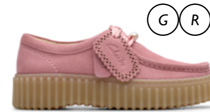
Dusty Rose Suede | CL26184585 | RRP 1499