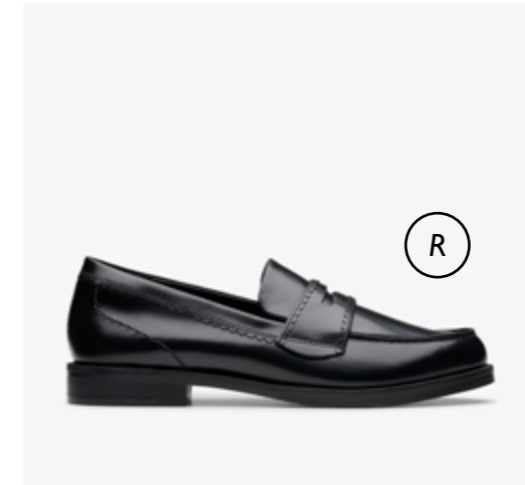
Black Leather | CL26181277 | RRP 1499

Designed for real life, your life - Our Straven Edge loafer is a hybrid shoe expertly crafted for easy everyday styling and office days alike. Prepped for ultra-versatile wear in rich leather, it features a scalloped trimmed upper and wheeling rand detail to create a crafted aesthetic - where our signature Contour Cushioned footbed is expertly placed for comfort that lasts as long as your day does.