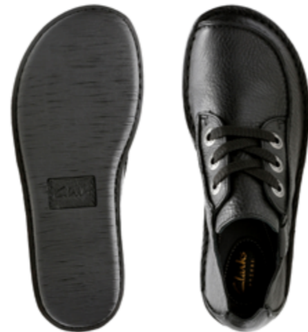
Black Leather | CL26181277 | RRP 1399

Premium leather | Breathable leather sock and lining | Grippy and flexible TPR outsole | UK 3-8, EU 35,5-42