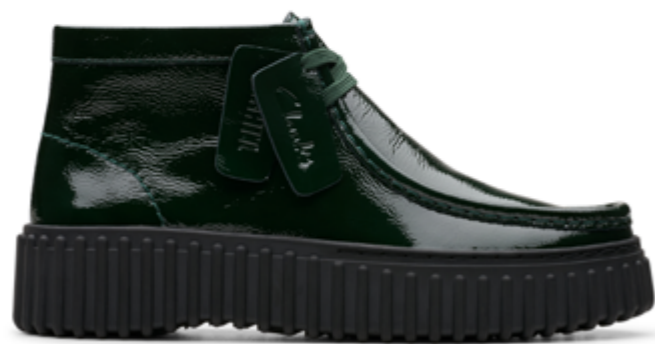
Green Patent | CL26184663 | RRP 1599