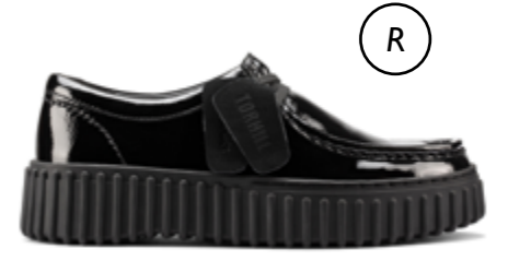
Black Patent | CL26179111 | RRP 1499