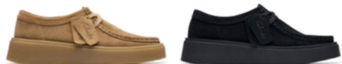
Dark Sand | CL26184946 | RRP 1699 | Black Suede | CL26184944 | RRP 1699

Premium uppers | Breathable leather sock and lining | TR outsole delivers ultimate underfoot traction | UK 3-8, EU 35,5-42