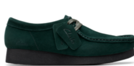
Dark Green Suede | CL26184613 | RRP 1499