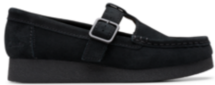
Black Suede | CL26183153 | RRP 1399

Wallabee EVO Bar combines a trending T-bar profile with premium materials and heritage design details. Arriving in soft, versatile suede, it's prepped to pair with countless casual ensembles. And, for a detail-focused finish, we've completed it with a crepe-effect sole and crafted topstitching.