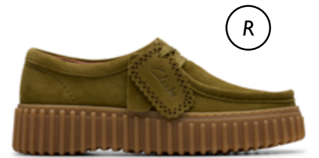
Olive Suede | CL26184586 | RRP 1499