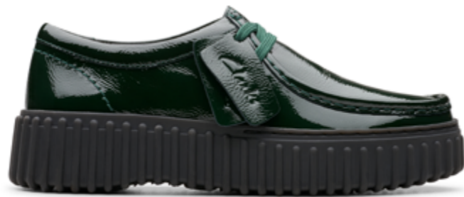
Green Patent | CL26184949 | RRP 1499

Premium green patent upper | Authentic lacing | Removable Contour Cushion footbed delivers lasting comfort | Grippy and flexible TR sole for ultimate traction | Two debossed fobs (Clarks logo and Torhill logo) to pay tribute to Clarks' heritage | UK 3-8, EU 35,5-42