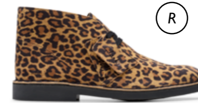
Leopard Suede | CL26182927 | RRP 1499