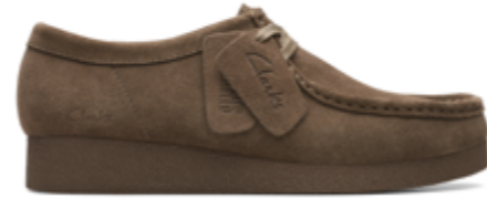
Olive Suede | CL26174748 | RRP 1499