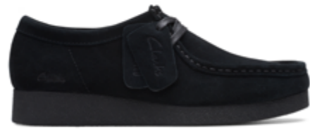
Black Suede | CL26174746 | RRP 1499