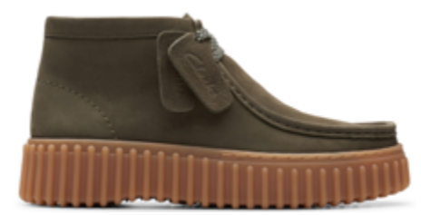
Dark Green Nubuck | CL26179356 | RRP 1599