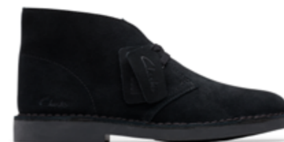
Black Suede | CL26182930 | RRP 1499