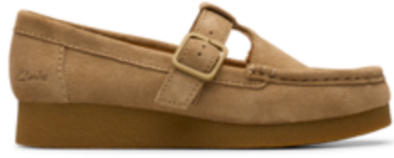
Dark Sand Suede | CL26183152 | RRP 1399