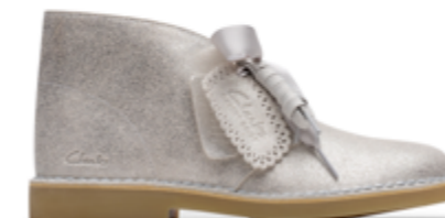
Silver Metallic | CL26182925 | RRP 1499