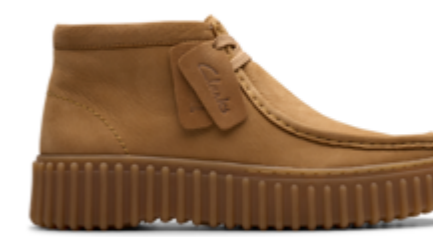
Light Tan Nubuck | CL26179359 | RRP 1599