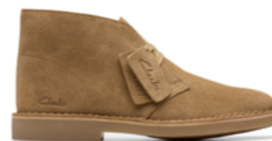
Dark Sand Sde | CL26182928 | RRP 1499