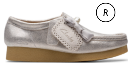
Silver | CL26184610 | RRP 1499

Premium leather uppers | Textured, crepe-effect rubber outsole offers maximum durability | Finished with suede logo fob as a guarantee of authenticity | UK 3-8, EU 35,5-42