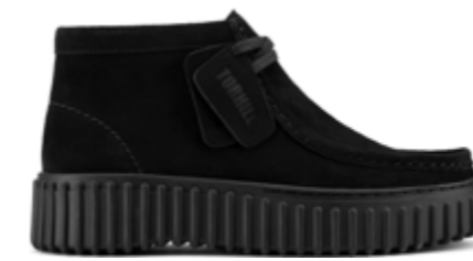
Black Suede | CL26179360 | RRP 1599