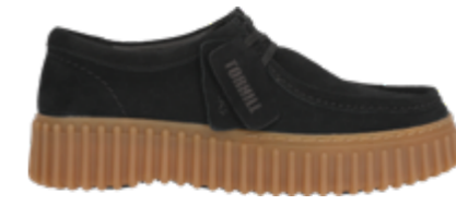
Black Suede | CL26172044 | RRP 1499