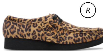
Leopard Suede | CL26184612 | RRP 1499