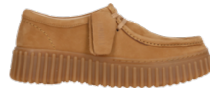
Light Tan Nubuck | CL26172084 | RRP 1499