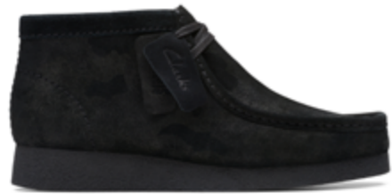
Black Suede | CL26174743 | RRP 1699