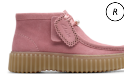
Dusty Rose Suede | CL26184636 | RRP 1599