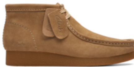
Dark Tan Suede | CL26174744 | RRP 1699