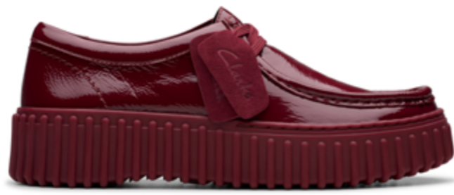
Bordeaux Patent | CL26179115 | RRP 1499