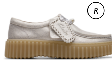
Silver Leather | CL26184587 | RRP 1499